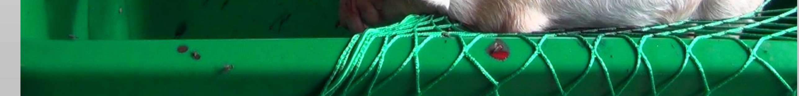
Fig 5: Restraining of piglets (2.5-30 kg), shooting position for newborn piglets is in the middle of the forehead, for elder pigs we shoot 2 cm above the connection line of the eyes, aiming at the tail

With the help of the manufacturer (turbocut Jopp GmbH, Bad Neustadt, Germany) the captive bolt apparatus was modified for smaller piglets by shortening the bolt extension length. Optimum shooting position and bolt length according to weight class were determined by shooting dead piglets and pathological examination with regard to brain stem damage.